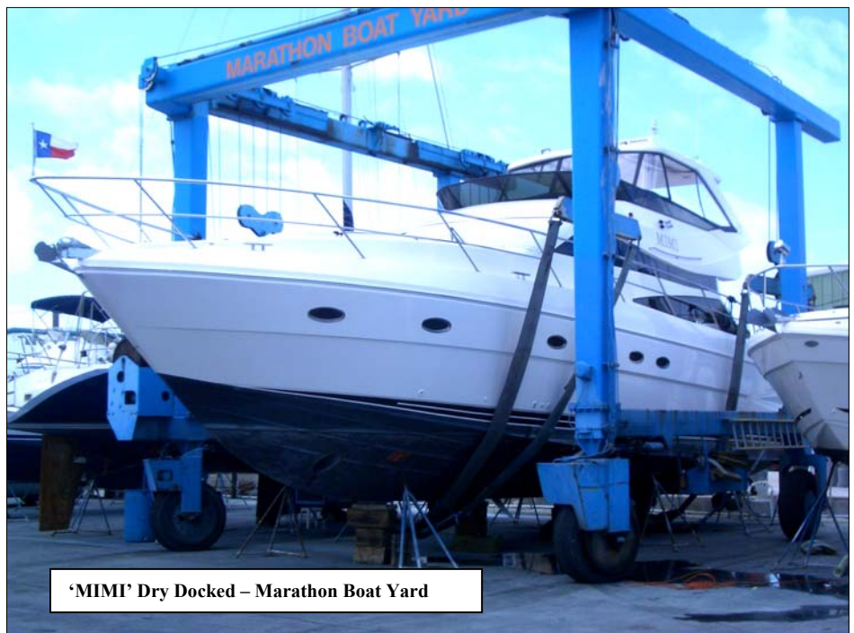
'MIMI' Dry Docked – Marathon Boat Yard