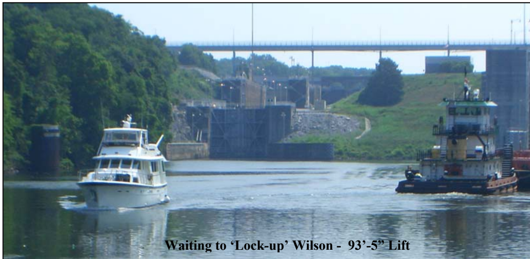
Waiting to 'Lock-up' Wilson - 93'-5" Lift

<M259.4> Florence, AL and Wilson Lock at 9:00am. The lockmaster estimates a 1-½ hour wait... setback... worse yet... it ends up 2 ½ hours. We're finally in at 11:30 for the 93'-5" lift and out at 12:10.