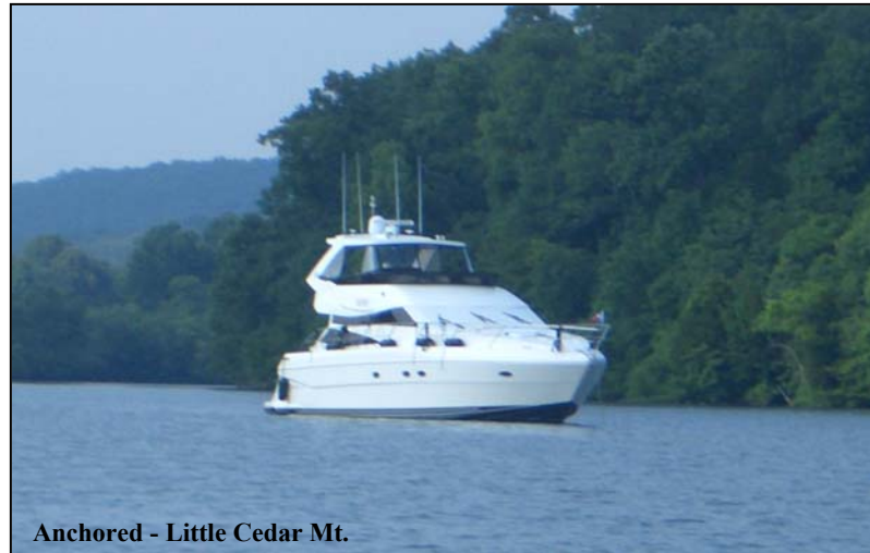
Anchored - Little Cedar Mt.